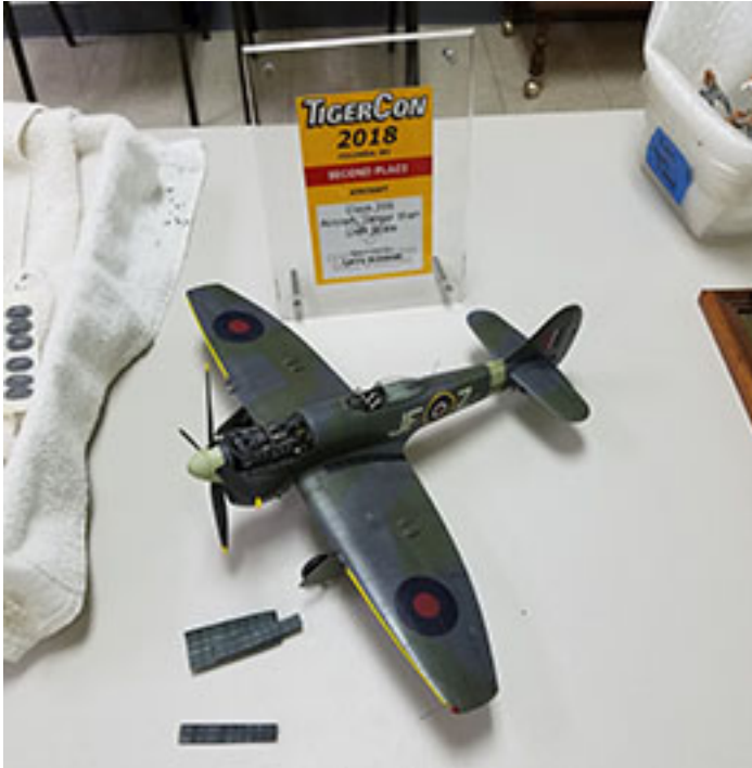
Jim Triola's 1:32 Tempest Mk. V that took Second Place in its category at TigerCon in Columbia, Mo. earlier that month.