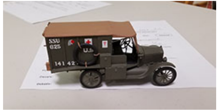
Dave Roeder placed second in “The Great War” with this Ford Model T Ambulance.