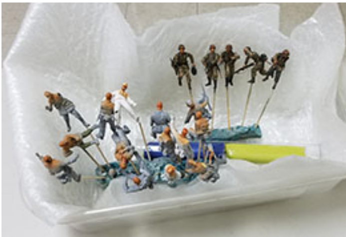
Rick Keasey brought in these 1:35 figures as a Work in Progress (WIP), and a tube of Kneadtite sculpting compound to show off as well.