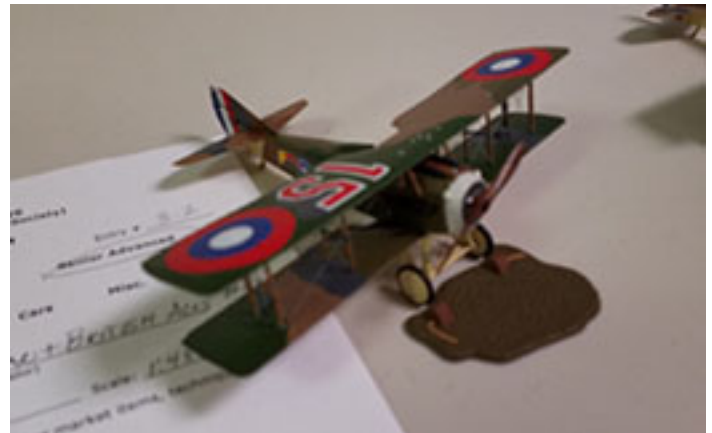
Bowman also entered another 1:48 SPAD XII in the Special Category.